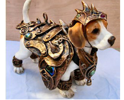
On the other hand, maybe the McNair riot crew isn't so indimidating after all...